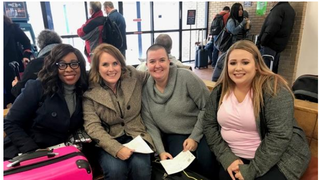
The Parent Ambassadors waiting to board an Amtrak with Executive

It was an exciting trip as some had never been on a train, Metro, or in a cab before! Coming from Hillsville, Roanoke, and Jarratt , the parents each represented a different region in our VA Head Start community, therefore each representing a different Congressional District.